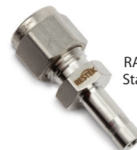
RAVE+ Guard: Stainless Steel